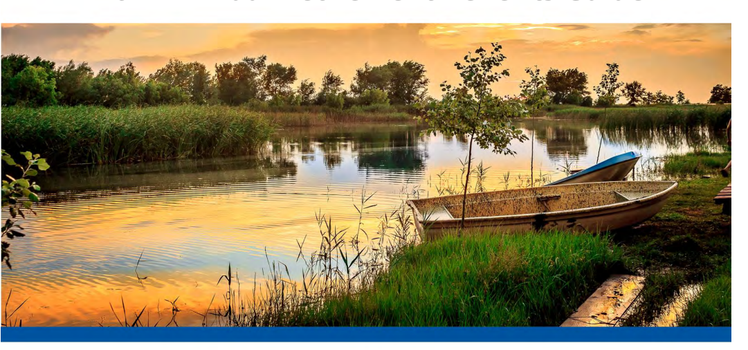
Flagstaff Unified School District #1